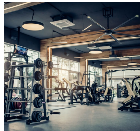
Full equipped gym