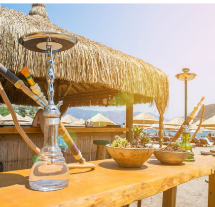
Shisha lounge & bar