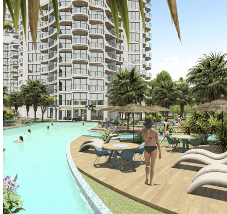
Family and Leisure Pool