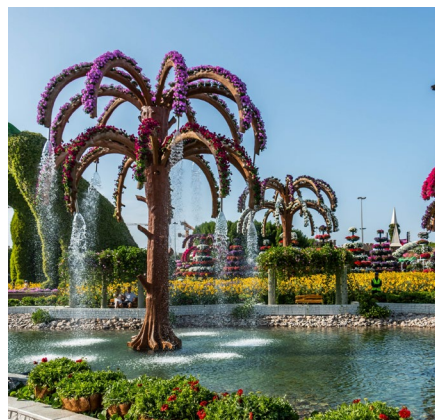
Fountain and Garden