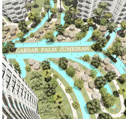
Unique palm pool