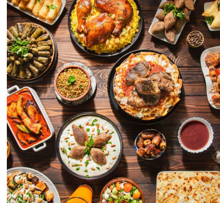
Authentic arabic restaurant