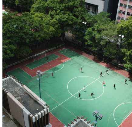
Tennis & football court