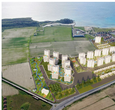
24/7 gated security